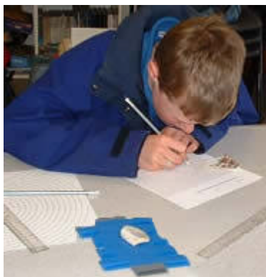
Pupil helping to create the archive for the excavation

An archive includes the finds, such as pottery, and all the measurements, drawings, photos, and the plans.