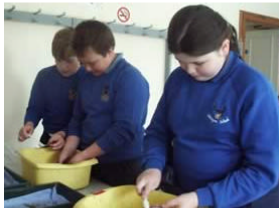
Pupils cleaning artifacts so they can be studied

We found pieces of metal, glass, pottery, charcoal, flint and slag. We know from these pieces how the people lived.