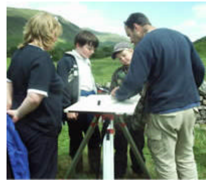
Here we are working!