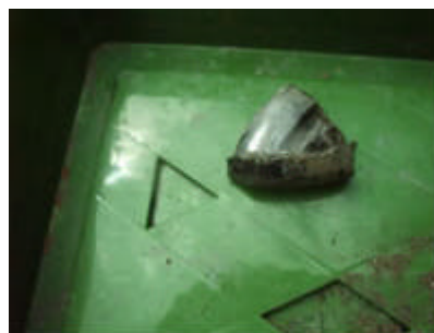
Glass fragment found while excavating

We were shown other artefacts found earlier such as a child's shoe. It was treated to preserve it.